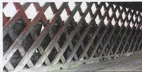
Triangulated beams, simple Town type

Among the characteristics of the Pont de la Frontière are the diagonally placed planks forming an open lattice pattern, the buttressing at mid-span, the vertical sheathing, the extended eaves, the wide lateral opening and straight line lintel at each portico. Substantial bedrock at either side of the brook eased construction requirements for sturdy foundation pilings. The Pont de la Frontière is classified in 6th position, with a heritage indicator of 88%, amongst the covered bridges of Quebec.