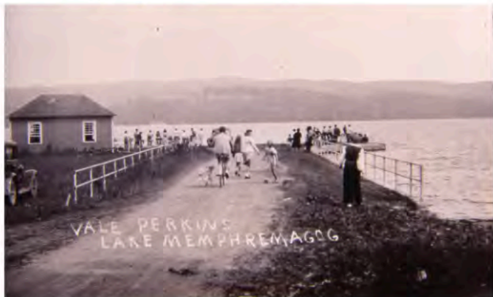
The Wharf, circa 1920